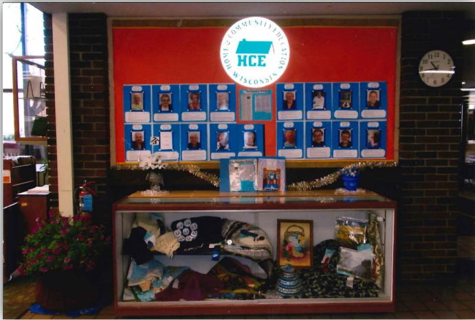
HCE display at the Chippewa Falls Public Library