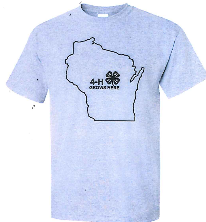
Sport Grey Black imprint