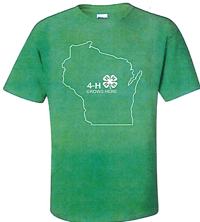
Irish Green White imprint