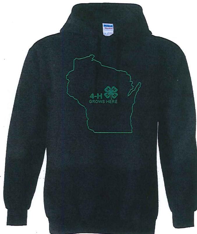
Black hood Union Bright Green imprint