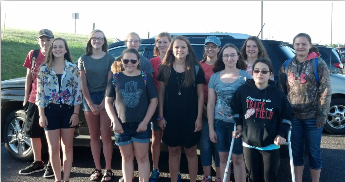
2016 4-H & Youth Conference attendees: