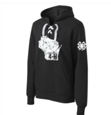
Sport-Tek Lace Up Pullover Hooded Sweatshirt $32.00