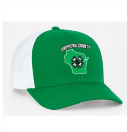
Pacific Trucker Mesh Cap $14.00