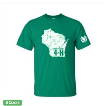
Gildan Ultra Cotton Short Sleeve T-Shirt $12.00