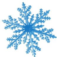
Executive Board Holiday Luncheon