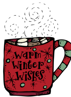
2019 HCE Week Library Display