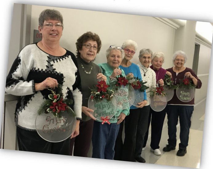
Craft & Hobby Workshop